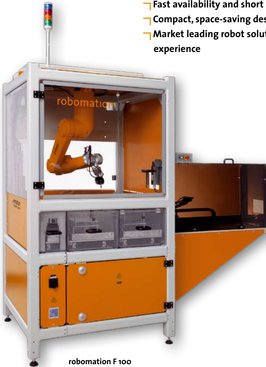
robomation F 100

robomation is the flexible standard module robot cell which will increase your productivity in manufacturing with workload capacity up to 1kg. The robomation is available in two flexible load/unload versions: