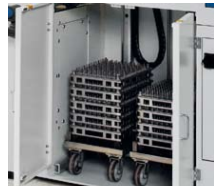
Pallet stacking box